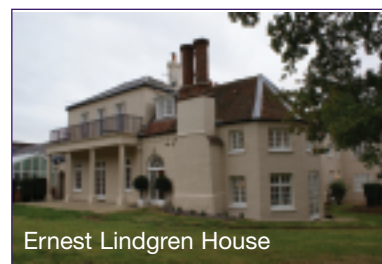
Ernest Lindgren House

The National Film Archive in Berkhamsted preserves one of the largest and most significant moving image collections in the world. As part of consolidation on the site they sold the listed buildings which formed their offices and these have been converted into "Archive Mews" funded by Close Brothers. The house has been converted into four luxury apartments and the cottage and barn form four further dwellings. In 1883 the OS map showed the buildings as an isolated farmstead and in 1966 the site was purchased to build a new film preservation centre for the NFA. Ernest Lindgren was the founder of the archive and first curator, holding the post for almost 40 years.